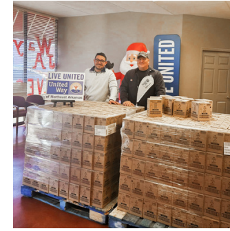
Unilever Shampoo Distribution