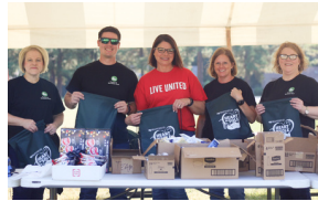
BANK - FARMERS & MERCHANTS BANK