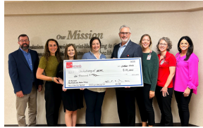
HEALTHCARE PROVIDER - ST. BERNARDS