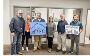
OVERALL LEADER - CITY WATER & LIGHT