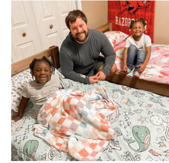
Sleep in Heavenly Peace