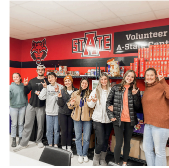
A-State Food Pantry