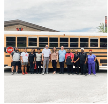
Corporate Outreach Partnership