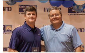
MANUFACTURER - FRITO LAY